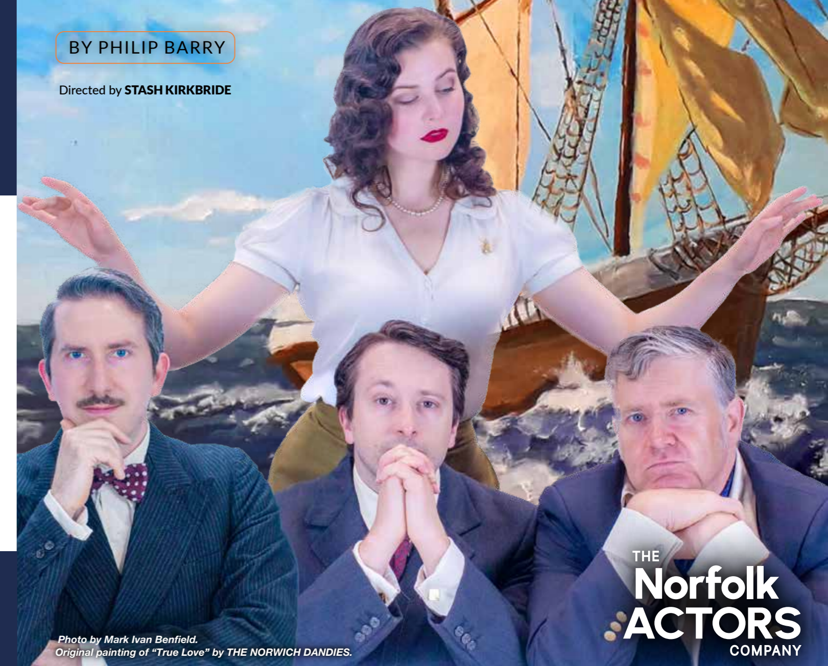
Original painting of "True Love" by THE NORWICH DANDIES.